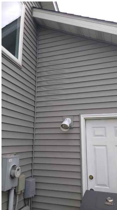
Damaged siding by Garage Walk-in Door